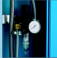
Air Filter / Auto-Drain / Regulator