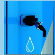
Water Faucet with Retractable Hose and Inlet Fittings