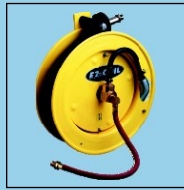
EZ-Coil Controlled Retraction Reel