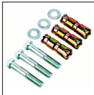
Installation Bolt Kit - Set of 3